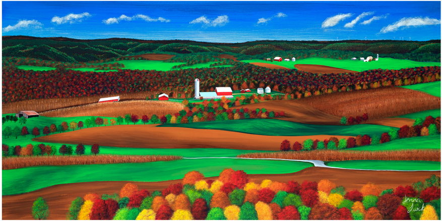
The Other Farm