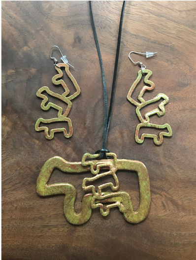
Effigy Mounds Bear Design