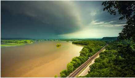
Cloud Gods Speak