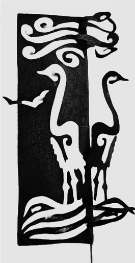
Positive Negative Heron