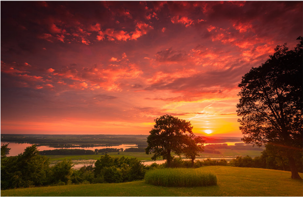
Sky on Fire